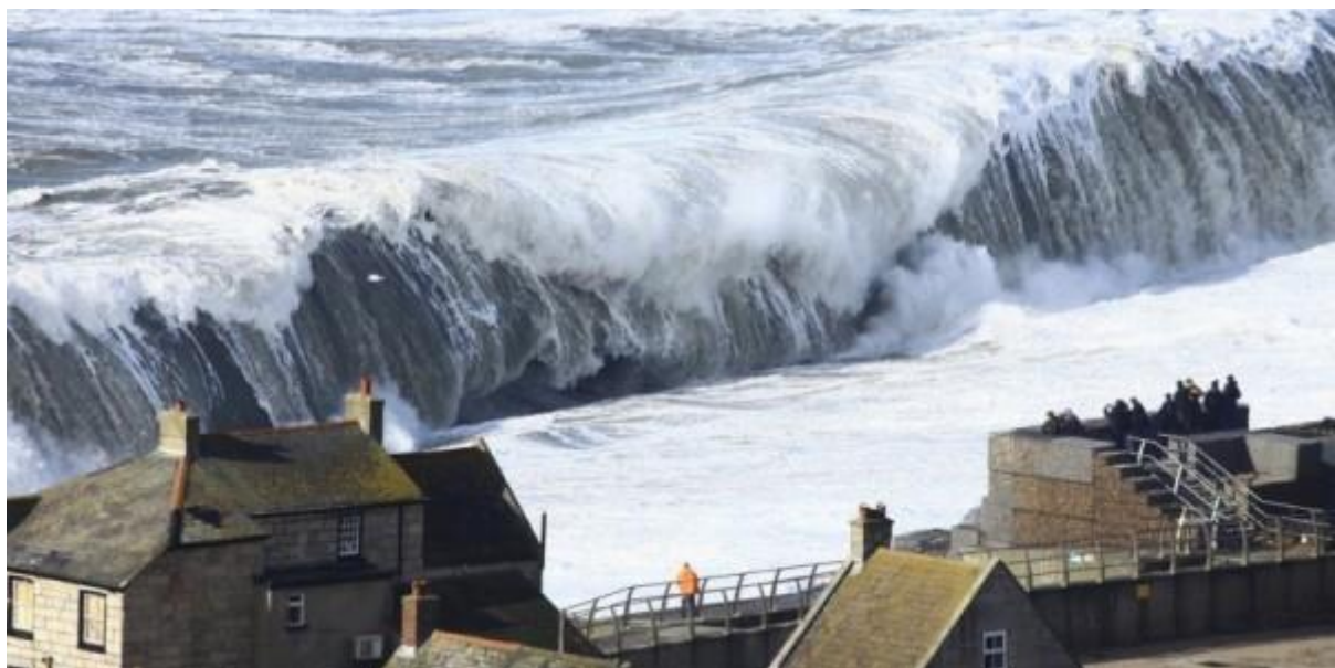
Chesil Beach in 2014