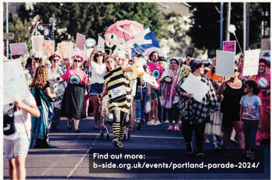
Find out more: b-side.org.uk/events/portland-parade-2024/

Join us on September 8th from dusk 'til dark as we bring these mystical beings to life at the Portland Parade! Meet at 6pm - Parade route from Easton Gardens to Portland Museum.