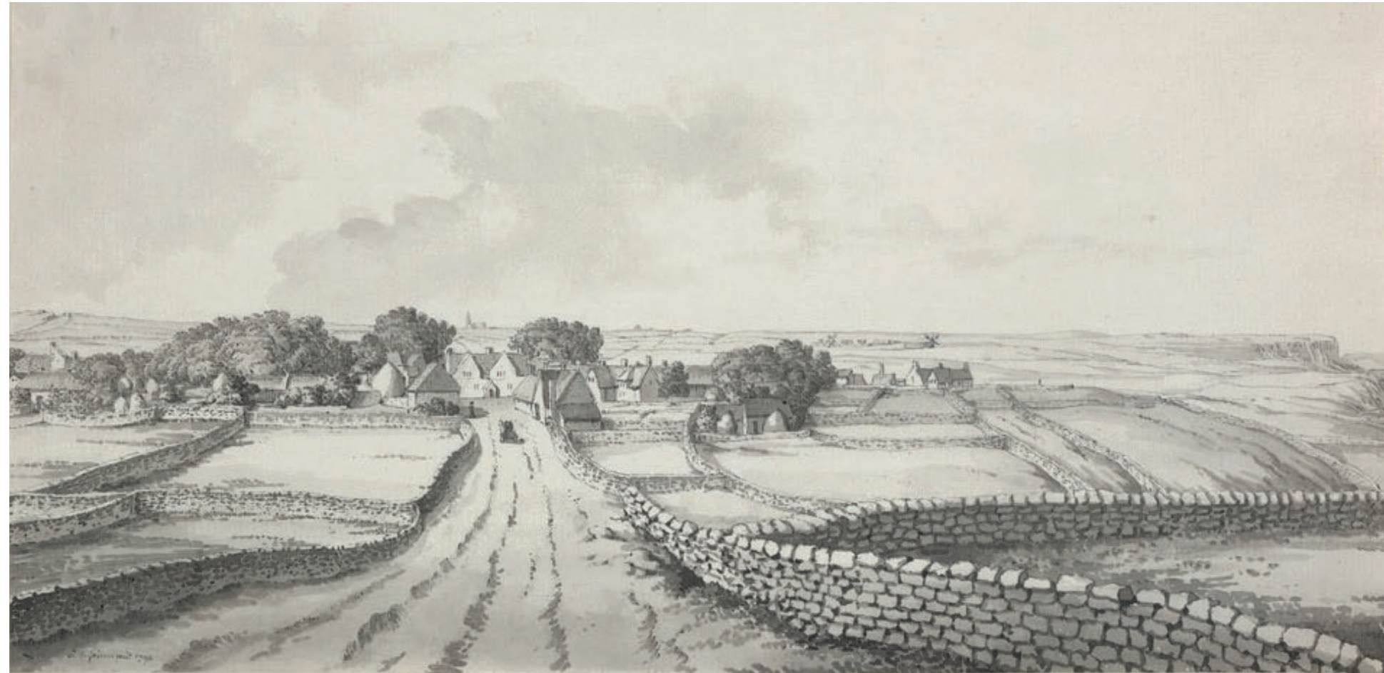
Southwell 1790 by Samuel Hieronymus Grimm