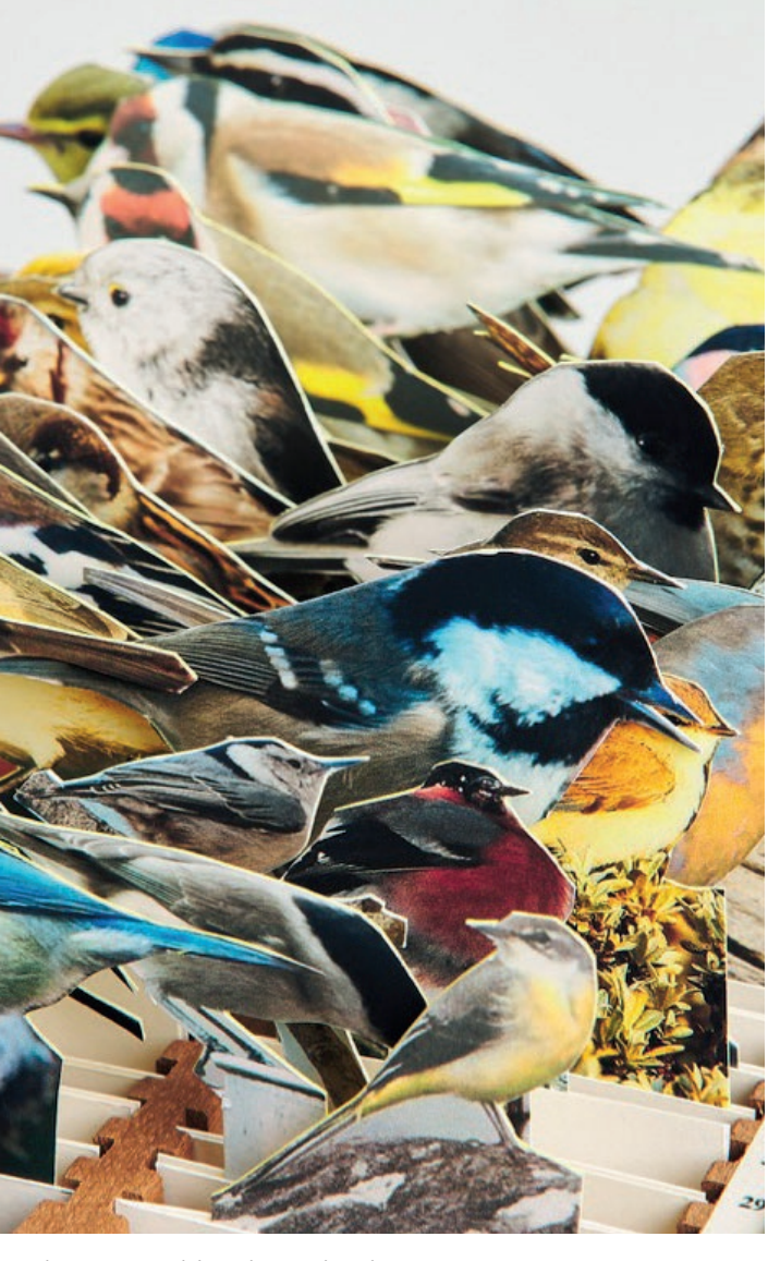
Emily Tracy: Fieldwork, Portland 2022

"Constant Effort' attempts to start conversation, to explore and celebrate this data, and its means of collection, through the presentation of a visual snapshot of species sightings at ten year intervals from 1962 to 2022. We can't always see the 'wood for the trees', but this installation will attempt to visualise some of the data on Portland species, incorporating birds, moths and flora and fauna, in order to spark conversation and understanding of the rich intertwined ecology that exists in 'The Last Landscape"